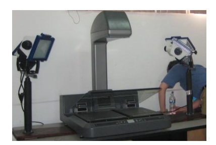
Installation of the CopiBook at the National Library of Haiti in February 2012.

In another ongoing project, the U.S. Embassy in Haiti partnered with dLOC in 2009 to assist Haitian libraries in the digital preservation of and increased access to Haitian patrimony. The Embassy purchased a CopiBook scanner, ideal for the digitization of large format and brittle materials, and sponsored two training workshops in 2009. In that first year, the Embassy supported an intern who worked with dLOC partners and digitized hundreds of pages of content. However, use of the equipment has waned in the last two years. As the traffic around Port-au-Prince has increased, travel to the Embassy to digitize materials has become even more difficult in the last two years. After several meetings with relevant partners, the