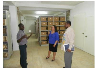
Above: Historical Archives at the National Archives of Haiti