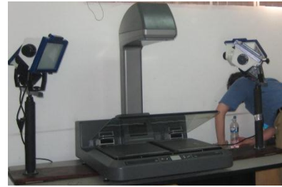
Installation of the CopiBook at the National Library of Haiti in February 2012.

In another ongoing project, the U.S. Embassy in Haiti partnered with dLOC in 2009 to assist Haitian libraries in the digital preservation of and increased access to Haitian patrimony. The Embassy purchased a CopiBook scanner, ideal for the digitization of large format and brittle materials, and sponsored two training workshops in 2009. In that first year, the Embassy supported an intern who worked with dLOC partners and digitized hundreds of pages of content. However, use of the equipment has waned in the last two years. As the traffic around Port-au-Prince has increased, travel to the Embassy to digitize materials has become even more difficult in the last two years. After several meetings with relevant partners, the stakeholders agreed that a location downtown would increase the usage and impact of this vital equipment. During the February 2012 visit, dLOC representatives met with the new director of the National Library, Emmanuel Menard, and finalized the installation of the CopiBook scanner in the National Library of Haiti, a centralized location providing easier access to all dLOC's partners in Haiti.