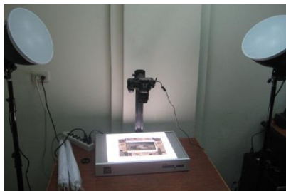
Light table and camera provided by PAIGH to support preservation at the National Archives.