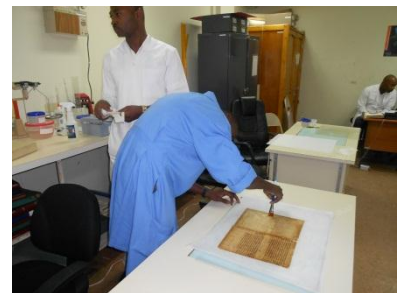
Above: Preservation Section restoring documents at the National Archives of Haiti.